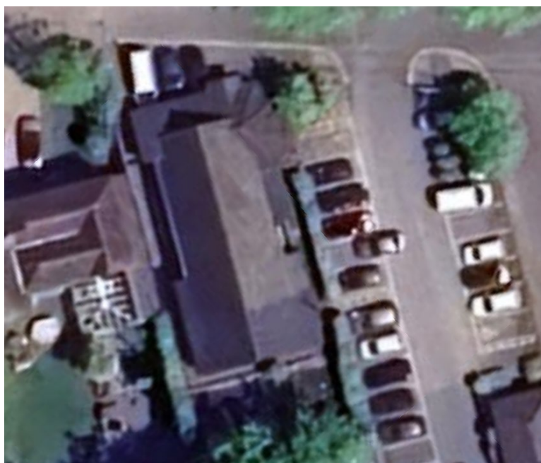
Parish Hall roof from Google Earth /// drama.steer.store