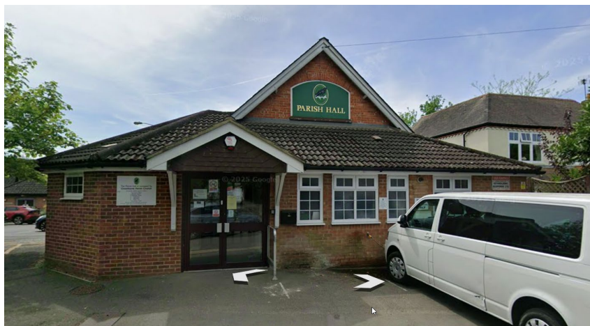
Parish Hall from Heath Hill Road

Built in the 1950s with a number of extensions since, the pitched roofs face east and west. The hall has a regular hirer, Becca's Nursery, which uses the hall 07:00-18:00 every weekday. The adjacent car park is owned by Bracknell Forest Council and has a 90minute parking limit. Longer term parking and storage for contractors can be arranged.