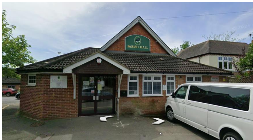
Parish Hall from Heath Hill Road

Built in the 1950s with a number of extensions since, the pitched roofs face east and west. The hall has a regular hirer, Becca's Nursery, which uses the hall 07:00-18:00 every weekday. The adjacent car park is owned by Bracknell Forest Council and has a 90minute parking limit. Longer term parking and storage for contractors can be arranged.