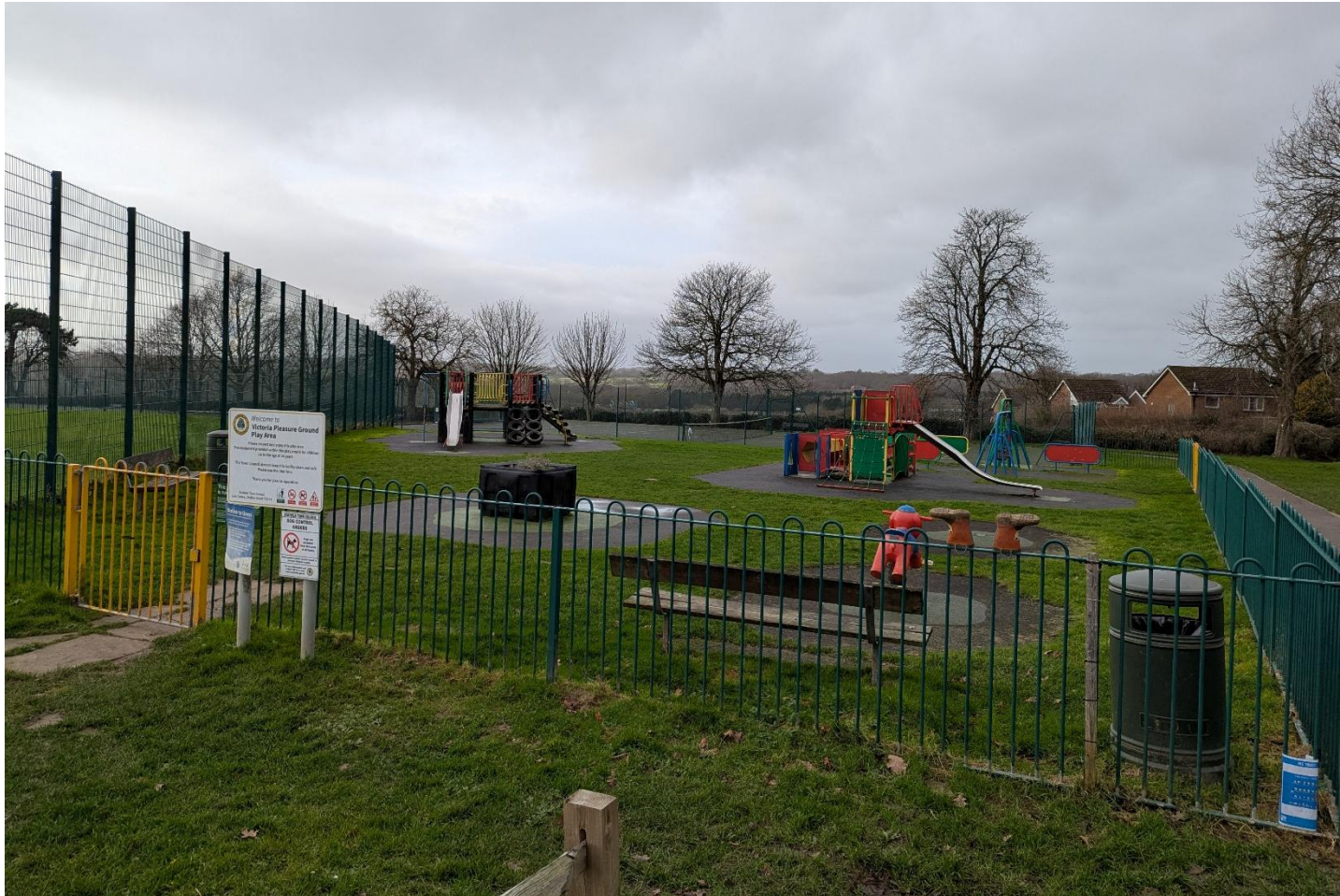
Figure. 3 – Photo of existing Victoria Play Area looking west