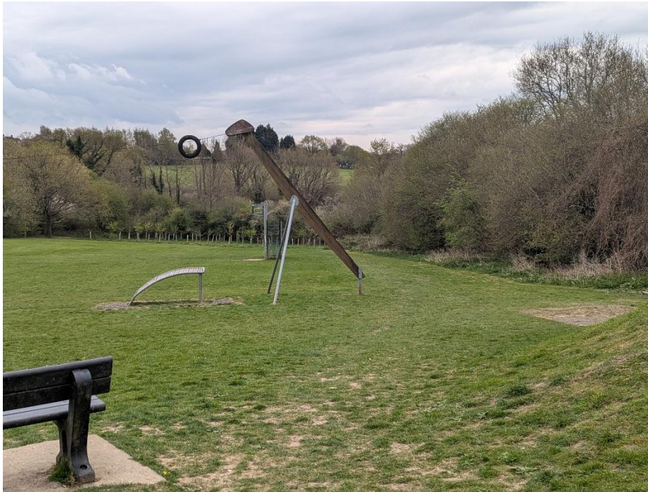
Figure. 9 – Photo of the current zip-wire due to be replaced mid-way down Hempstead Recreation Ground. Looking south.