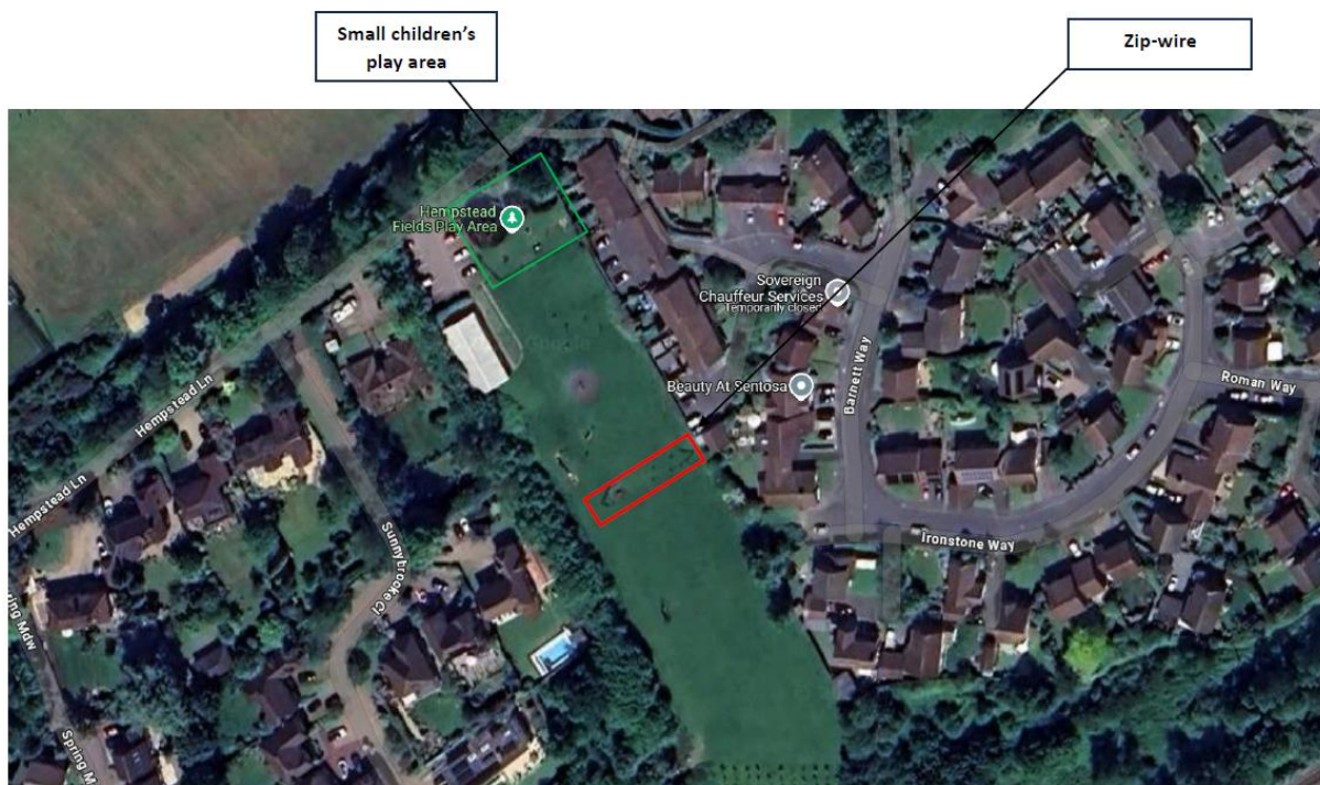
Figure. 8 – Extract from Google maps of Hempstead Play Area and Recreation ground

The piece of equipment we're looking to replace is the Zip-wire which is located approximately mid-way down the slope and into the recreation ground (south of the smaller play area).