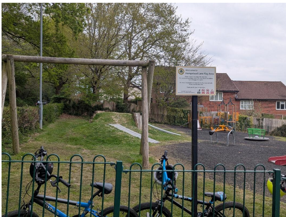
Figure. 11 – Photo of the smaller children's play area located on the left (east) as you walk into Hempstead Recreation Ground from Hempstead Lane.