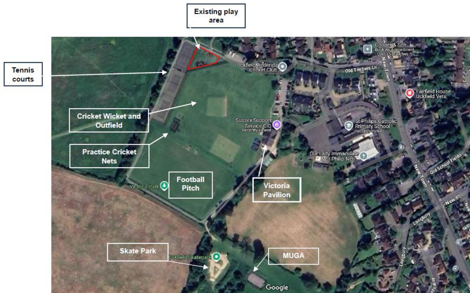
Figure. 2 – Google Maps Extract – Full bird's eye view of Victoria Pleasure Ground.