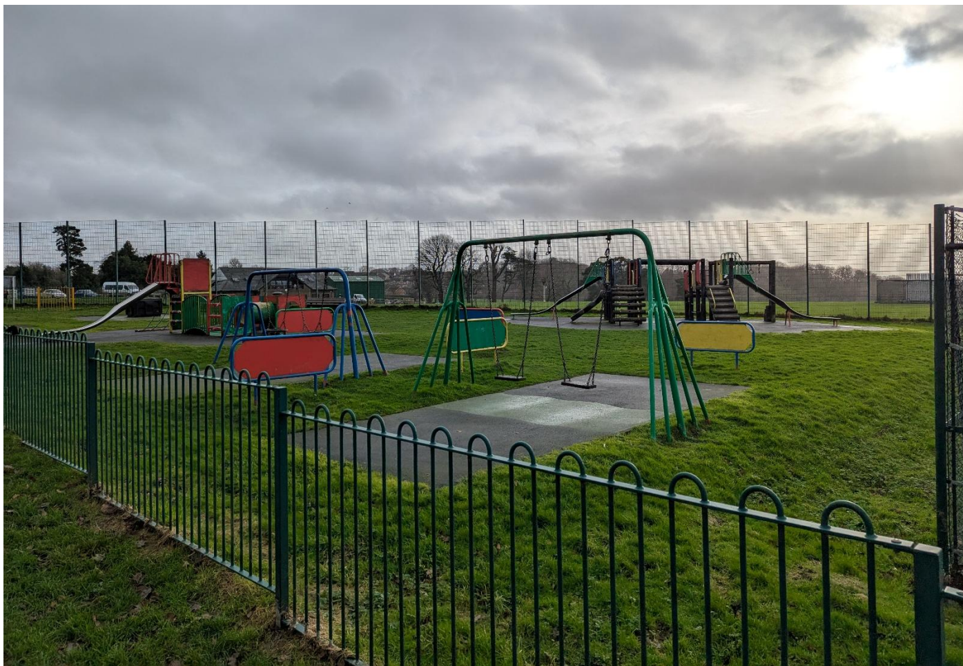
Figure. 5 – View of existing play area from footpath looking south