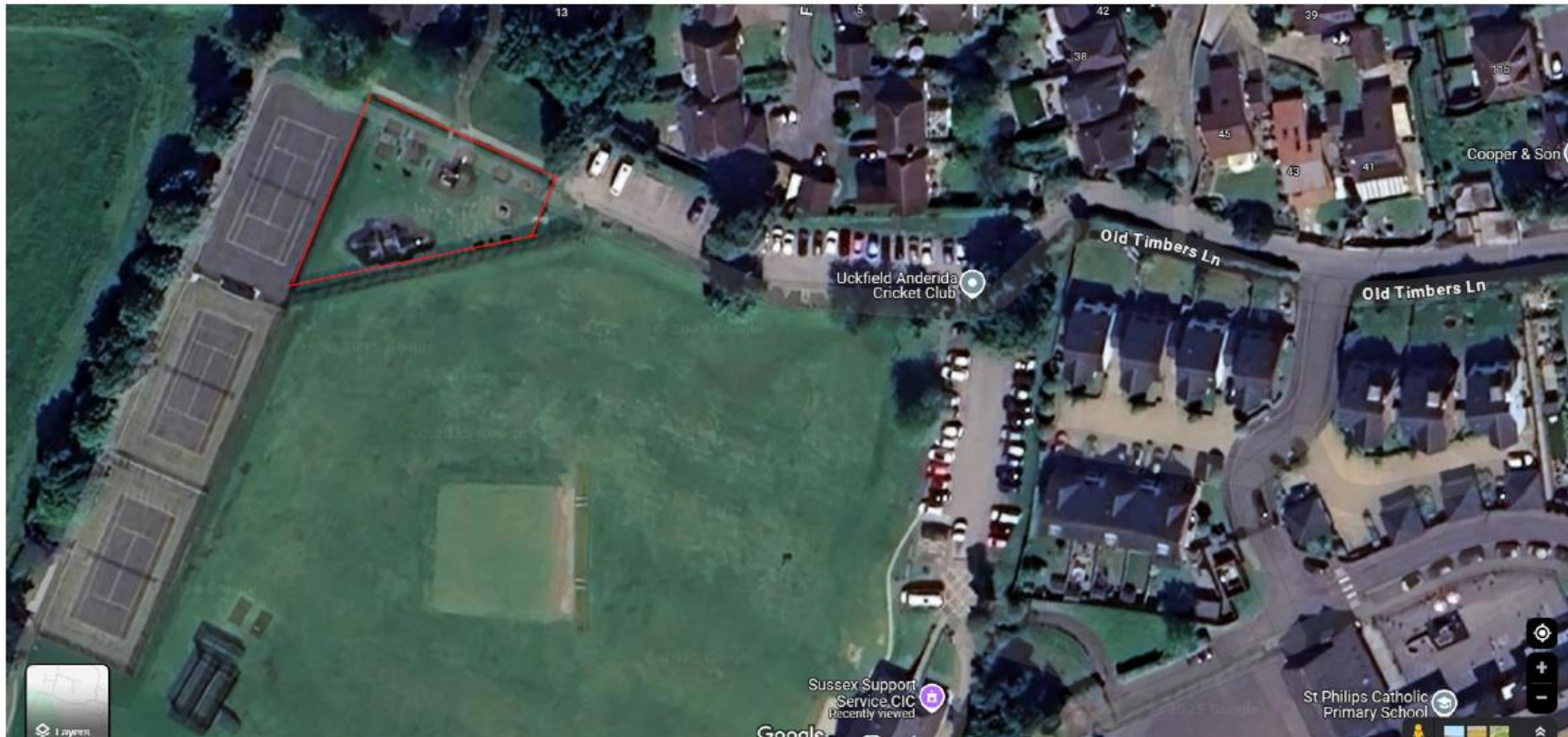
Figure. 1 – Google Maps Extract – North Western Corner of Victoria Pleasure Ground. Existing play area outlined in red.