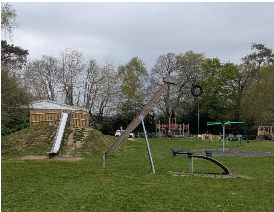
Figure. 10 – Photo of the current zip-wire due to be replaced mid-way down Hempstead Recreation Ground. Looking north.