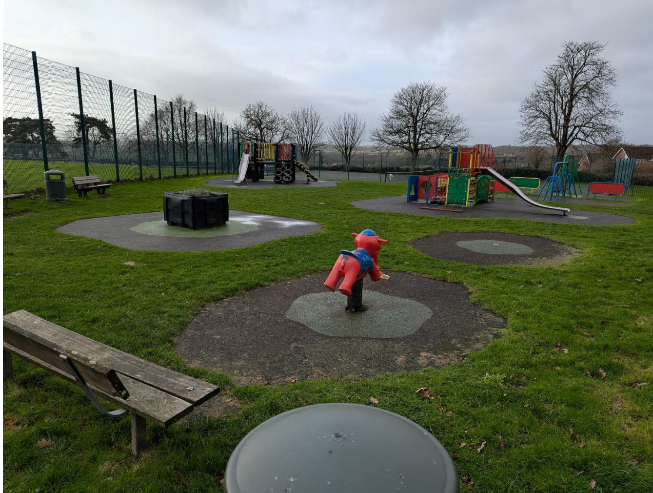
Figure. 4 – Closer perspective of existing Victoria Play Area, looking west from the fenceline.