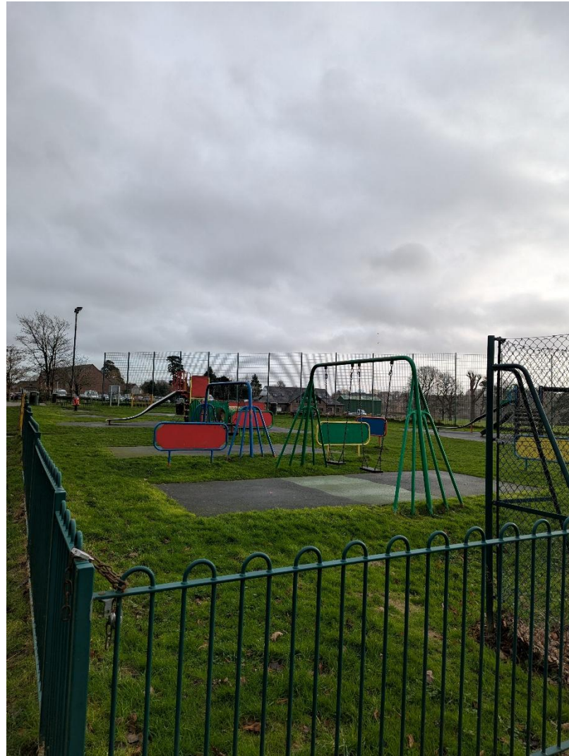
Figure. 6 – View of existing play area from footpath looking east