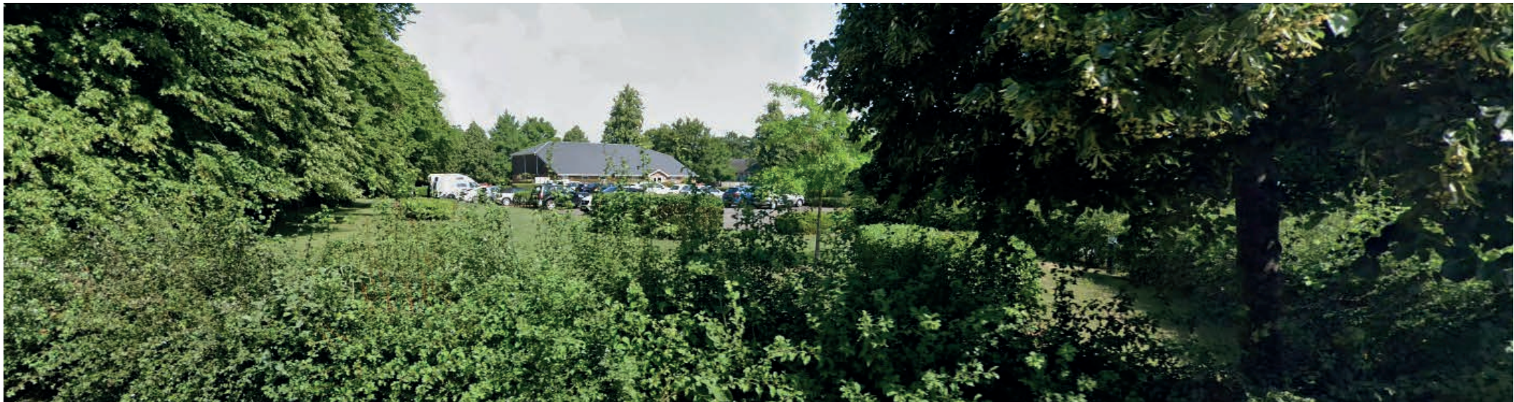
STREETVIEW FROM KNOWLE AVE