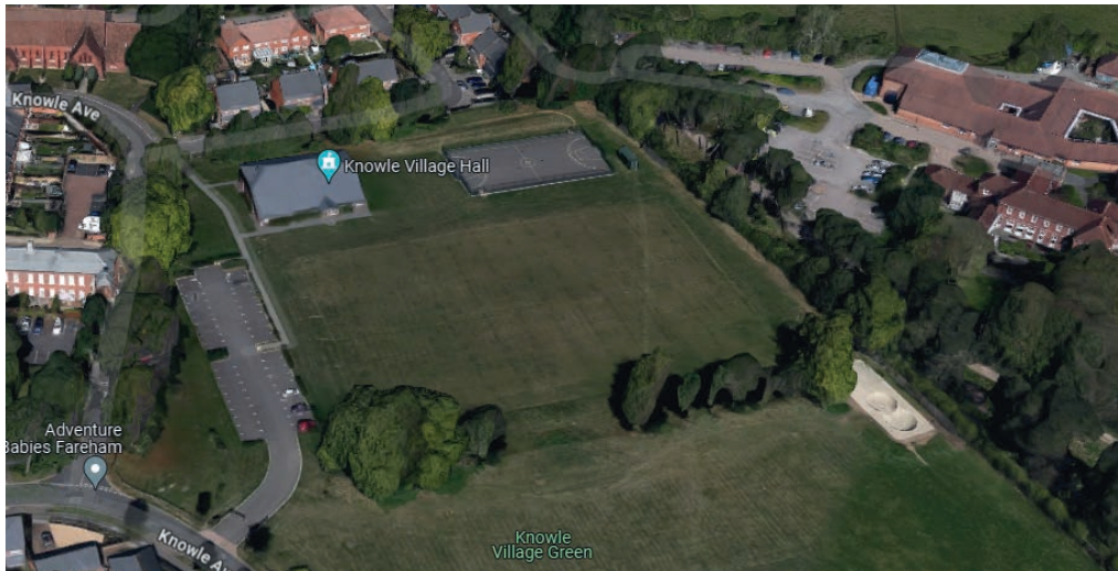
BIRD VIEW