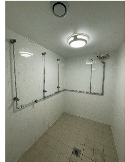
CHANGING / SHOWER ROOMS