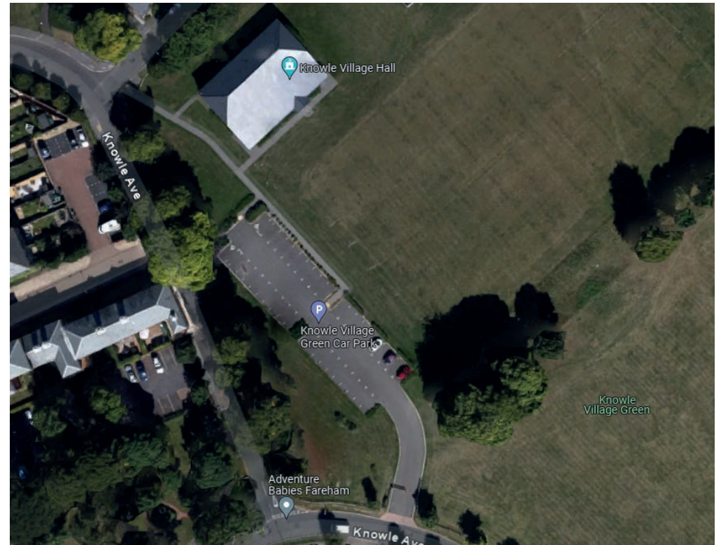
AERIAL VIEW SHOWING THE PARKING LAYOUT