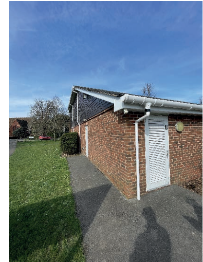
FRONT / SIDE ELEVATION