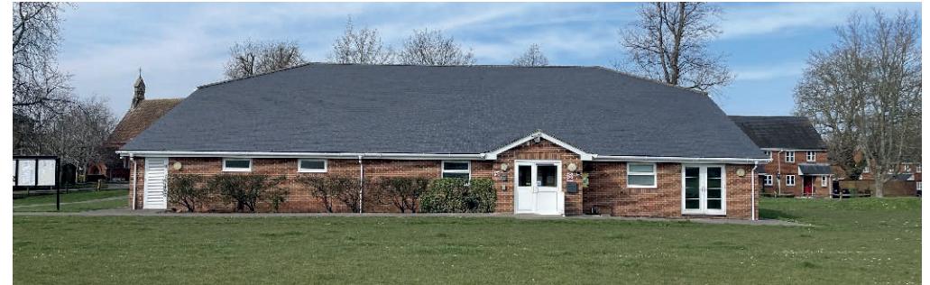
FRONT OF THE BUILDING