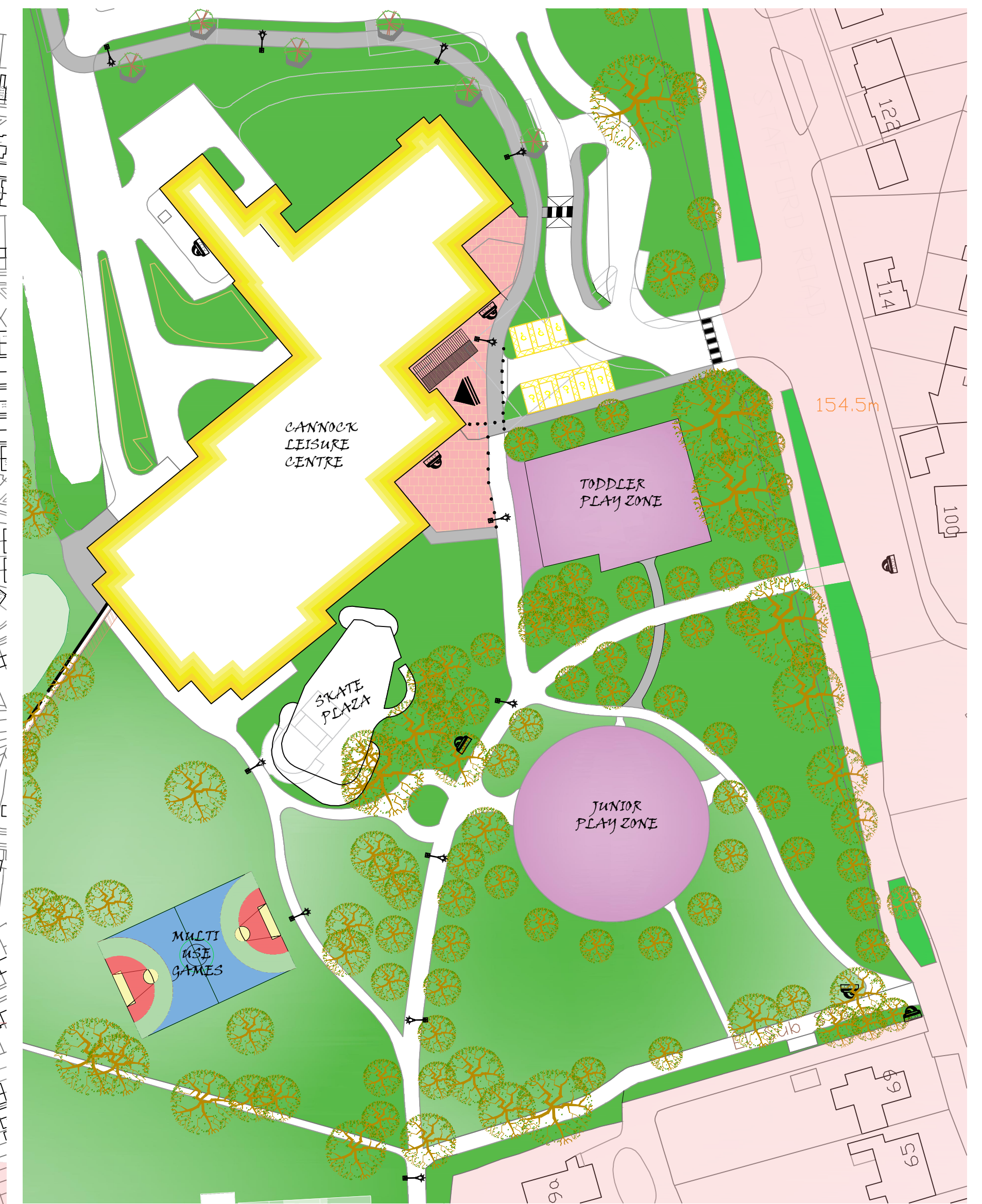
Play area design - Scale 1:750 @A0