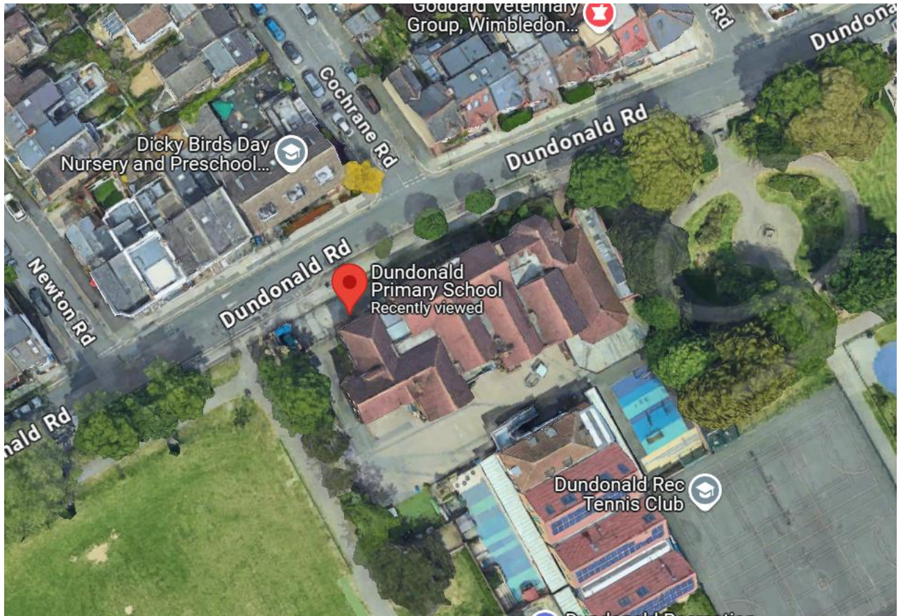
Site Location Plan of Dundonald Primary School