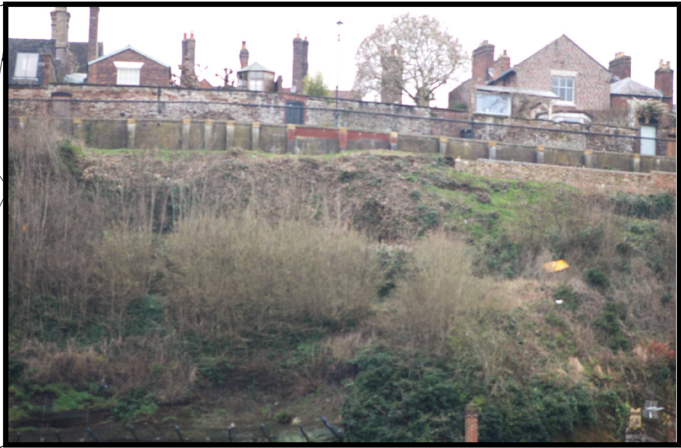
Proposed Works Stabilise existing lower retaining wall and make safe existing slope, to include area of previous landslide