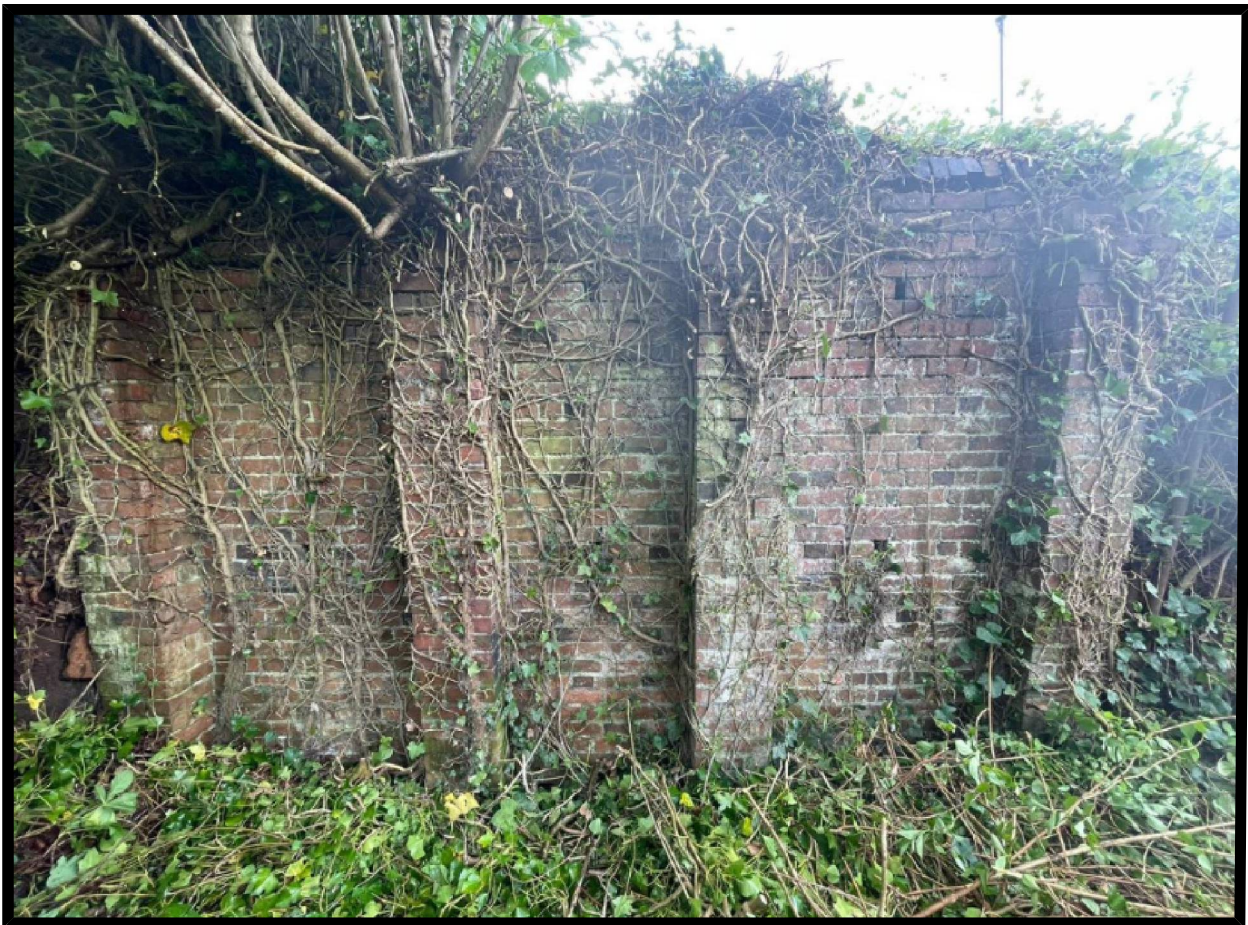
Lower Retaining Wall To be restrained