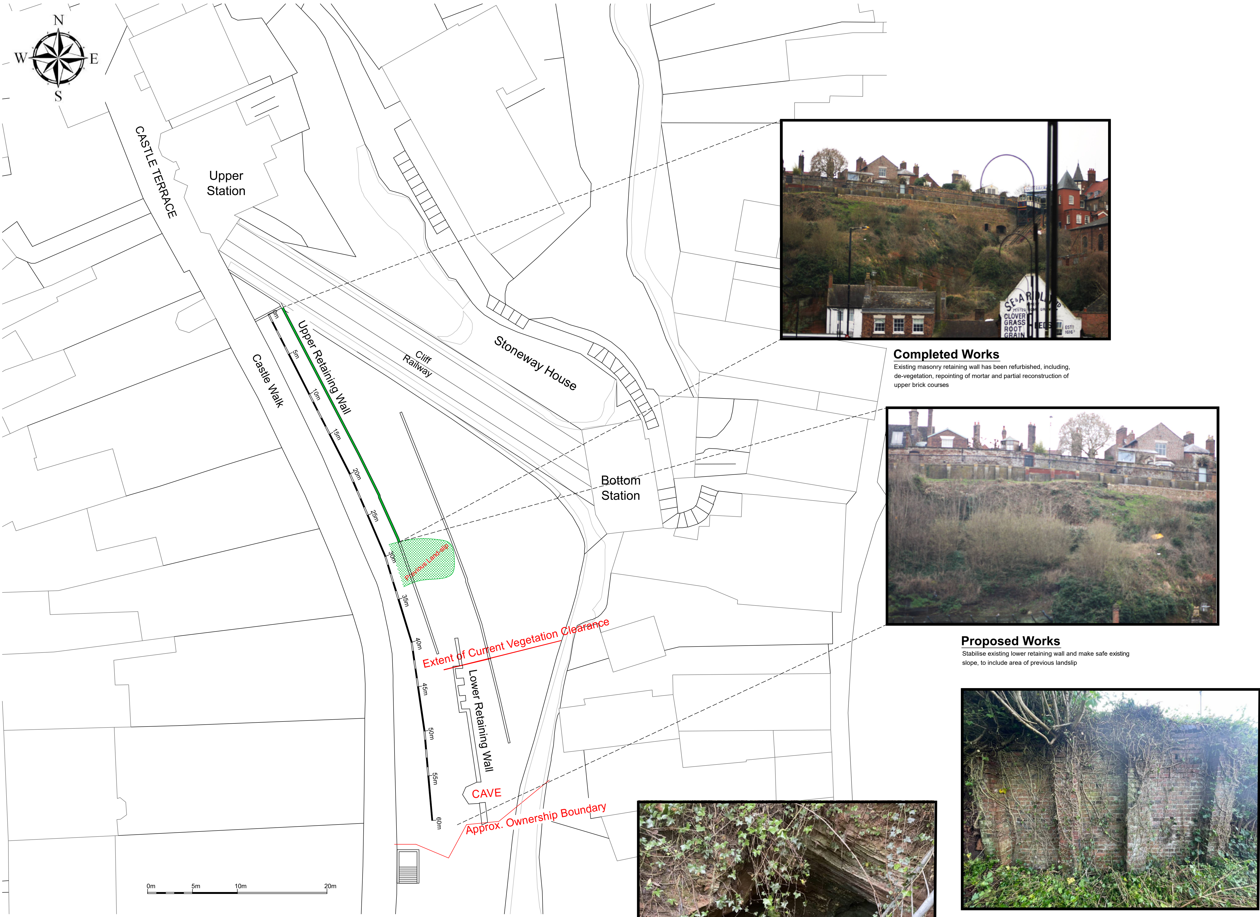
PROPOSED SITE PLAN Scale 1:200