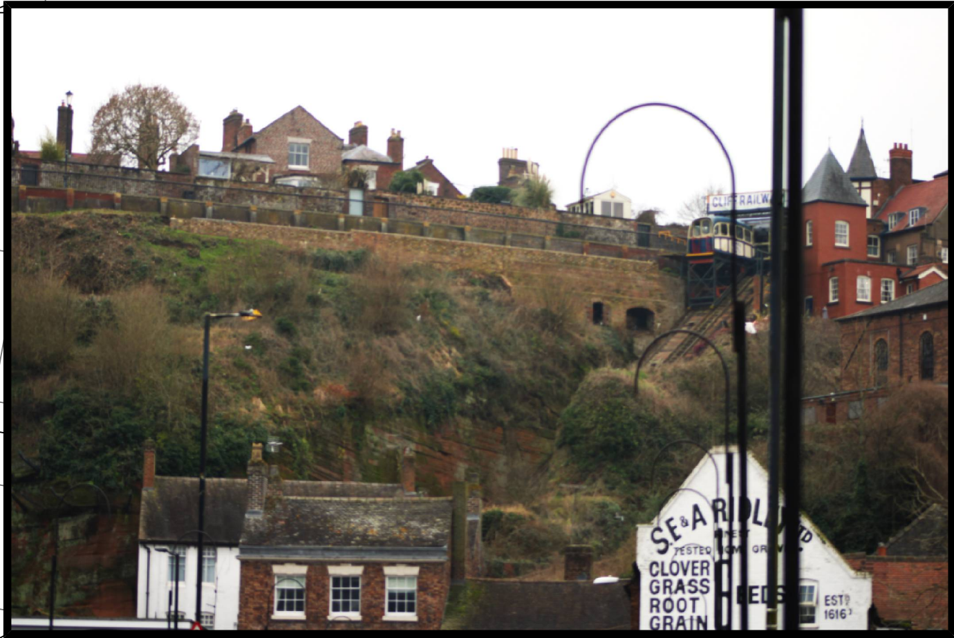
Completed Works Existing masonry retaining wall has been refurbished, including, de-vegetation, repointing of mortar and partial reconstruction of upper brick courses