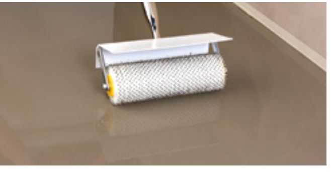
Figure 1 Spiked screed roller

Close attention must also be paid to subfloor levelling. Level, smooth subfloors will vastly improve the aesthetic appearance of any finished floor covering installation. This is of particular importance when installing Homogeneous Vinyl Tiles; Rubber Tiles and Luxury Vinyl Tiles.