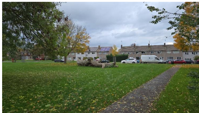
Existing fenced-off area